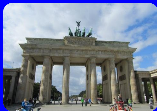
Brandenburg Gate, Berlin

The GSGP Workshop's Organizing Committee